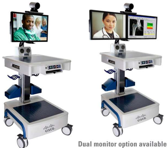
Figure 1. Cisco TelePresence Clinical Presence System

The Cisco TelePresence® portfolio creates an immersive, face-to-face experience over the network - empowering you to collaborate with others like never before. Through a powerful combination of technologies and design that allows you and remote participants to feel as if you are all in the same room, the Cisco TelePresence portfolio has the potential to provide great productivity benefits and transform your business. Many organizations are already using it to control costs, make decisions faster, improve customer intimacy, scale scarce resources, and speed products to market.