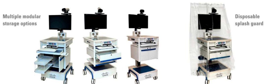
Figure 2. Modular Storage Options

Figure 2 shows the multiple modular storage options of the Clinical Presence System.