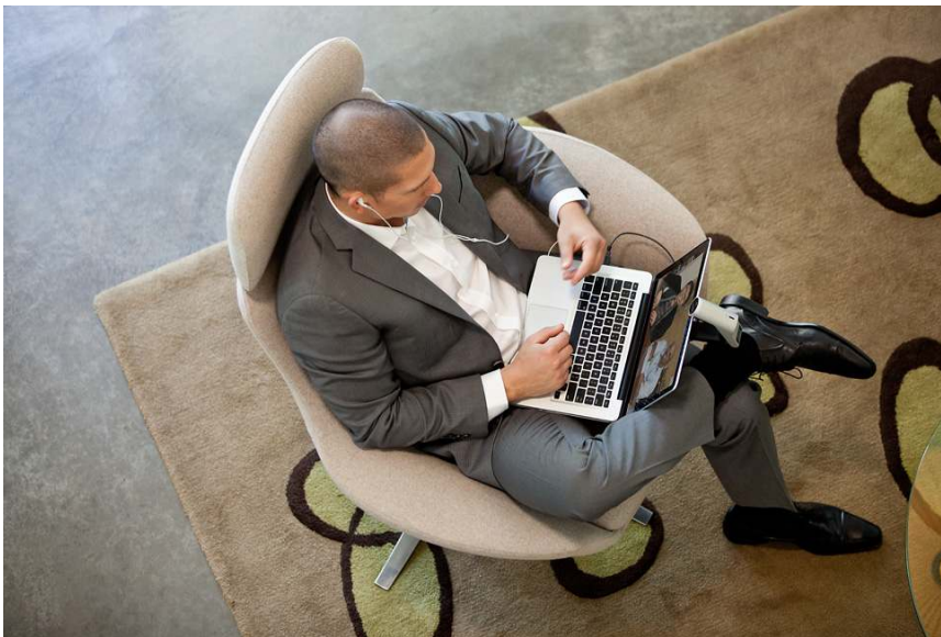
Figure 1. Cisco Jabber Video for TelePresence

The Cisco TelePresence® portfolio creates an immersive, face-to-face experience over the network - empowering you to collaborate with others like never before. Through a powerful combination of technologies and design that allows you and remote participants to feel as if you are all in the same room, the Cisco TelePresence portfolio has the potential to provide great productivity benefits and transform your business. Many organizations are already using it to control costs, make decisions faster, improve customer intimacy, scale scarce resources, and speed products to market.