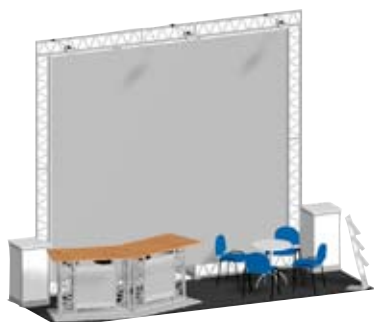
Stand Cisco Expo Mainpartner

Die unten aufgeführten Stände sind in Ihrem gebuchten Leistungspaket enthalten. Die Stände werden für Sie komplett produziert, aufgebaut und vorbereitet – inklusive Sitzgelegenheit, Prospektständer, Beleuchtung, Internet- und Stromanschluss. Weitere Technik und individuelles Informationsmaterial bringen Sie bitte selbst mit. Die Rückwand und Pultblende können Sie individuell nach den Richtlinien Ihres Unternehmens gestalten. Die Produktion dieser Flächen erfolgt durch uns.