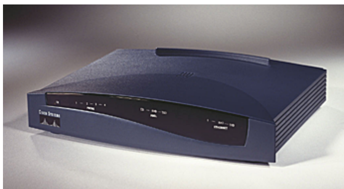
Figure 1 The Cisco SOHO 76 Router