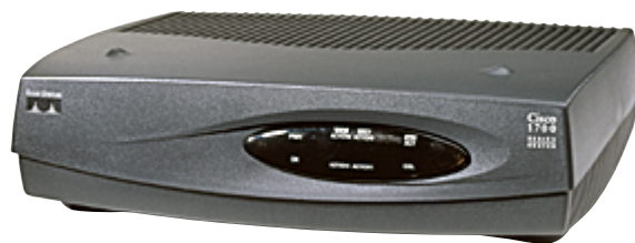
Figure 1: The Cisco 1701 ADSL Security Access Router

The Cisco 1701 router combines the cost benefits of DSL service with the advanced routing capability required for business use of the Internet. Cisco business-class DSL delivers strong security features, including wire-speed Triple Data Encryption Standard (3DES) VPN (with the optional