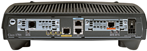
Figure 3: Rear View of the Cisco 1701 Router