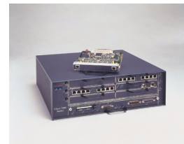
Figure 1: Two-Port and One-Port T1 and E1 High Capacity Enhanced Digital Voice Port Adapter and Cisco 7200 VXR Series Router

The enhanced digital voice port adapters are highly integrated solutions offering a leap forward in voice-channel density and application flexibility. These single-width port adapters incorporate two or one universal ports that can be configured for either T1 or E1 connection with high-performance digital signal processors (DSPs) that support up to 120 channels of compressed voice (see Table 1 for the number of channels supported by each port adapter). Integrated channel service units/digital service units (CSU/DSU) echo cancellation, and Digital Signal Level 0 (DS0) drop and insert functionality eliminate the need for external line-termination devices and multiplexers, which simplifies network design and management.