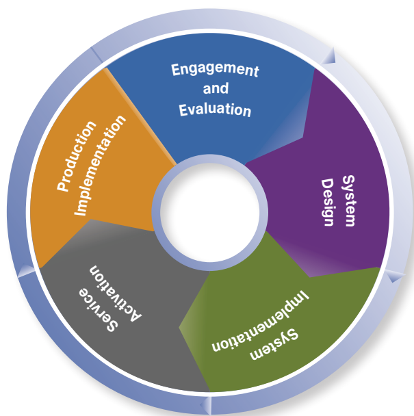
Cisco IronPort Managed Email Security implementation model

Customized Solution Cisco security experts work with you to design an email security solution that is tailored to your business environment. They evaluate needs, create the solution design, implement the design and activate all required services. After production, the customer selects a management model that fits their needs.