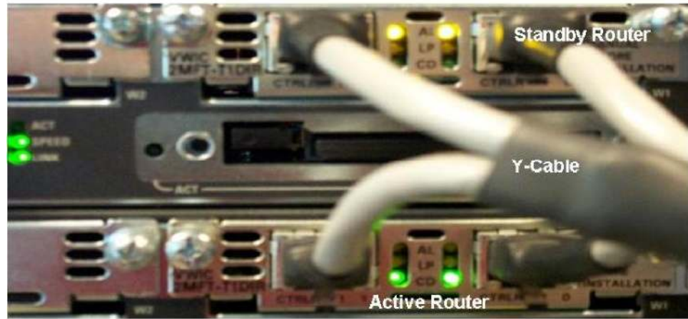
Figure 2. Cisco MWR 1941 Redundancy with a Y-Cable

A custom T1/E1 Y-cable is required for Cisco MWR 1941 redundancy (Figure 2). Y-cables connect the two interfaces on the Cisco 2-Port RJ-48 T1/E1 RAN WAN Interface Card to a single T1/E1 backhaul in the BTS or Node B. The Y-cable that is connected to a pair of redundant Cisco MWR 1941 routers can differentiate the active router from the standby router through the LEDs. The active router carrier detect is green, the standby alarm is amber with no carrier detect.