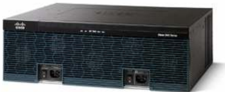
Figure 2. Cisco VG 224 Analog Phone Gateway