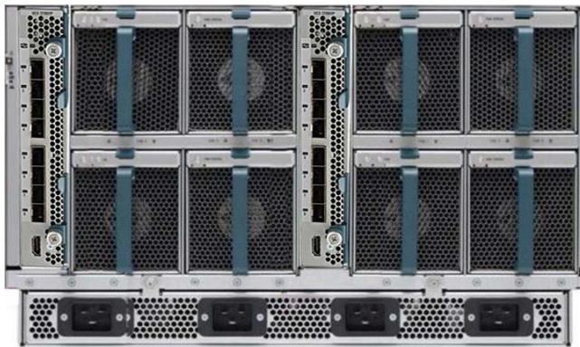
Figure 2. Rear of Cisco UCS 5108 Blade Server Chassis with Two Cisco UCS 2208XP Fabric Extenders Inserted

Cisco UCS 2200 Series Fabric Extenders fit into the back of the Cisco UCS 5100 Series chassis. Each Cisco UCS 5100 Series chassis can support up to two fabric extenders, enabling increased capacity as well as redundancy (Figure 2).