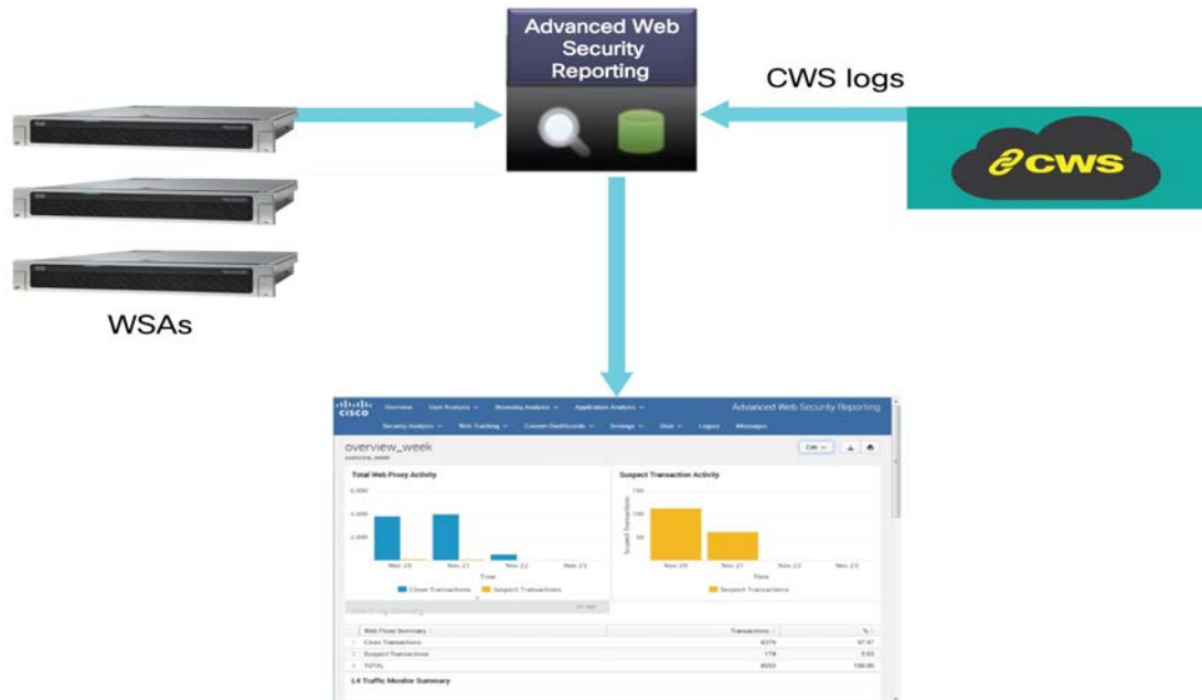
Figure 1-1 General architecture of the Advanced Web Security Reporting system.