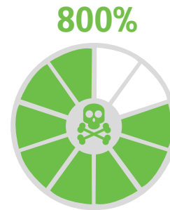
Increase in ransomware attacks