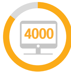
Security incidents reported daily

Unfortunately, small businesses are a common target.