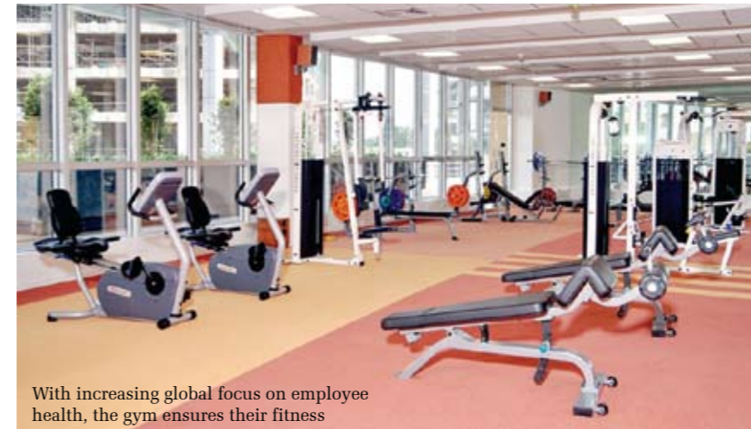
With increasing global focus on employee health, the gym ensures their fitness