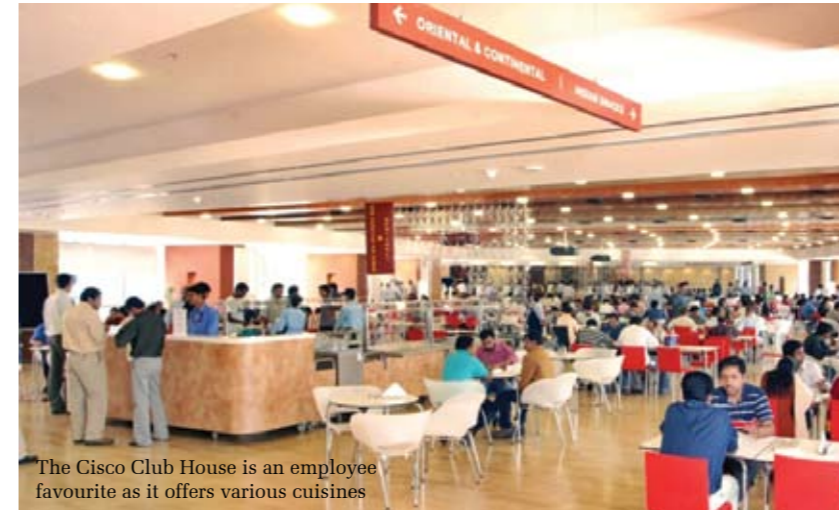
The Cisco Club House is an employee favourite as it offers various cuisines