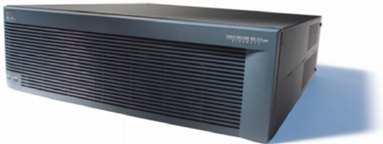
Figure 1. Cisco PIX 535 Security Appliance