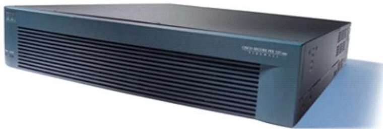
Figure 1. Cisco PIX 525 Security Appliance