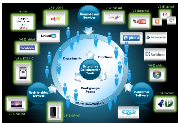
Figure 1. “Three Mega Business Trends Will Reshape the Tech Sector,” Forrester Research, November 2008