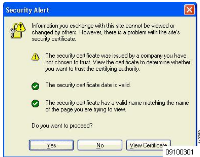
Figure 1: Typical Web-Browser Security Alert

When web authentication is enabled (under Layer 3 Security), users might receive a web-browser security alert the first time that they attempt to access a URL.