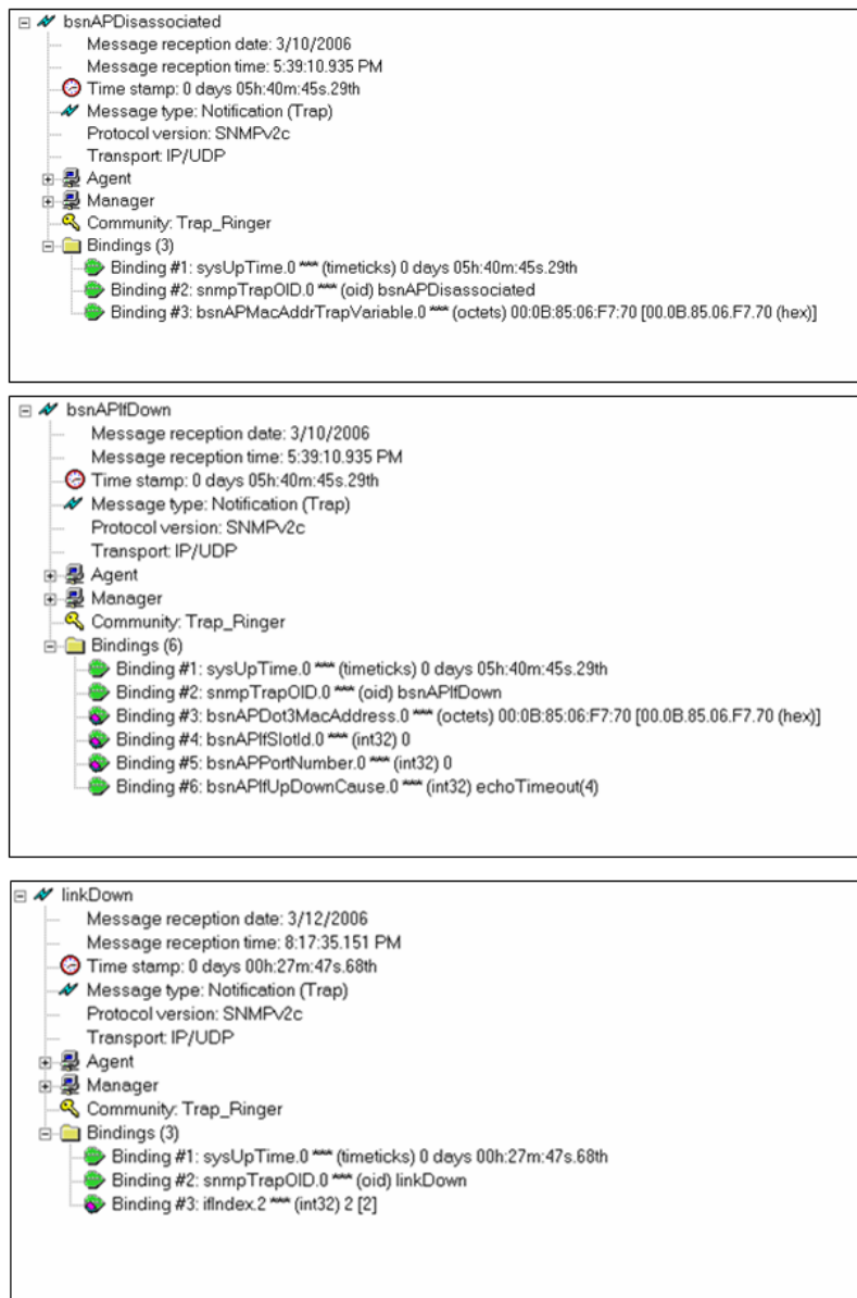
Figure D-1 AP Disassociated, AP Interface Down, and Link Down Traps