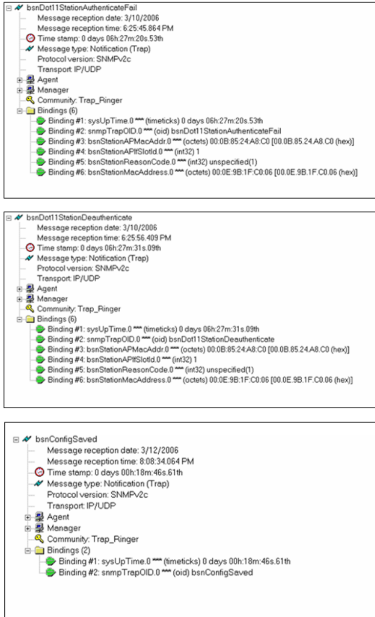
Figure D-2 Client Authentication Failure, Client De-Authenticated, and WLC Configuration Saved Traps