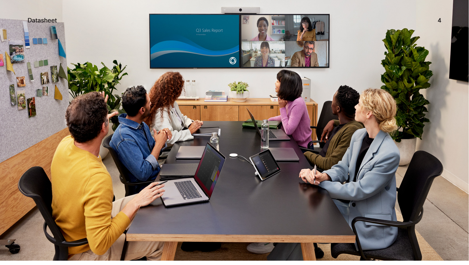
Figure 2. Cisco Room Bar and the tabletop Cisco Room Navigator running the native Microsoft Teams Rooms experience.