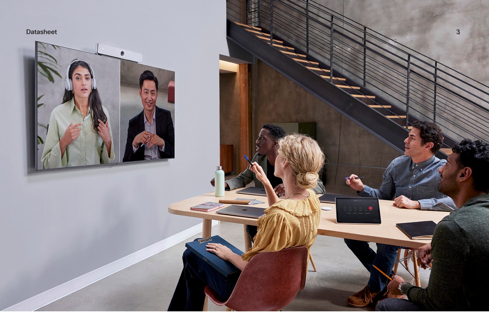
Figure 1. Cisco Room Bar running on the native Cisco RoomOS experience in an open huddle space

Cisco Room Bar powers your best video meetings ever, in a bar. It is a compact yet powerful video collaboration device providing stunning video conferencing on any meeting platform, boundless flexibility, and inclusive meeting experiences in your focus rooms, huddle spaces, and small meeting rooms.