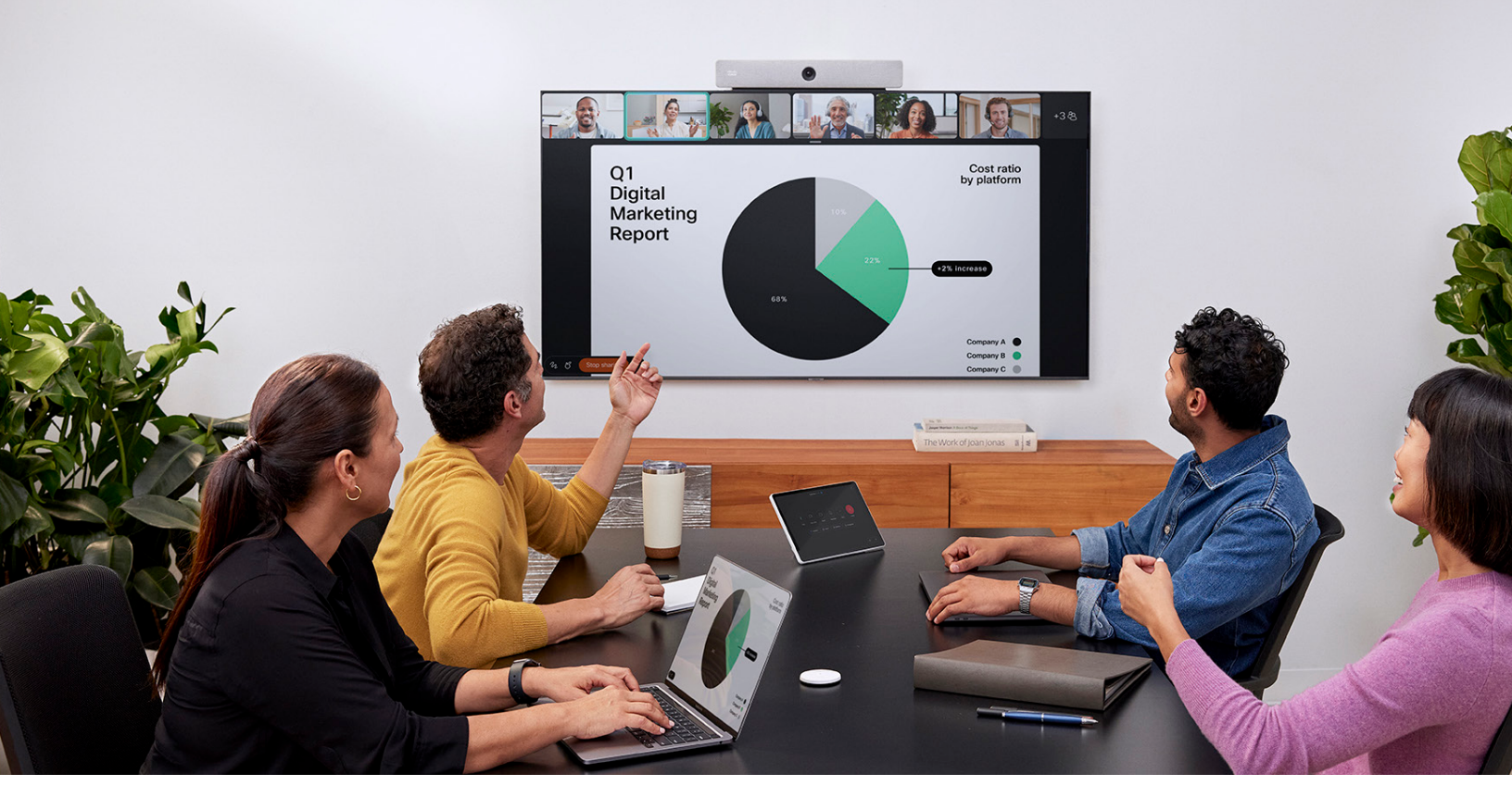
Figure 3. Cisco Room Bar used for video conferencing and wireless content sharing in a small meeting room