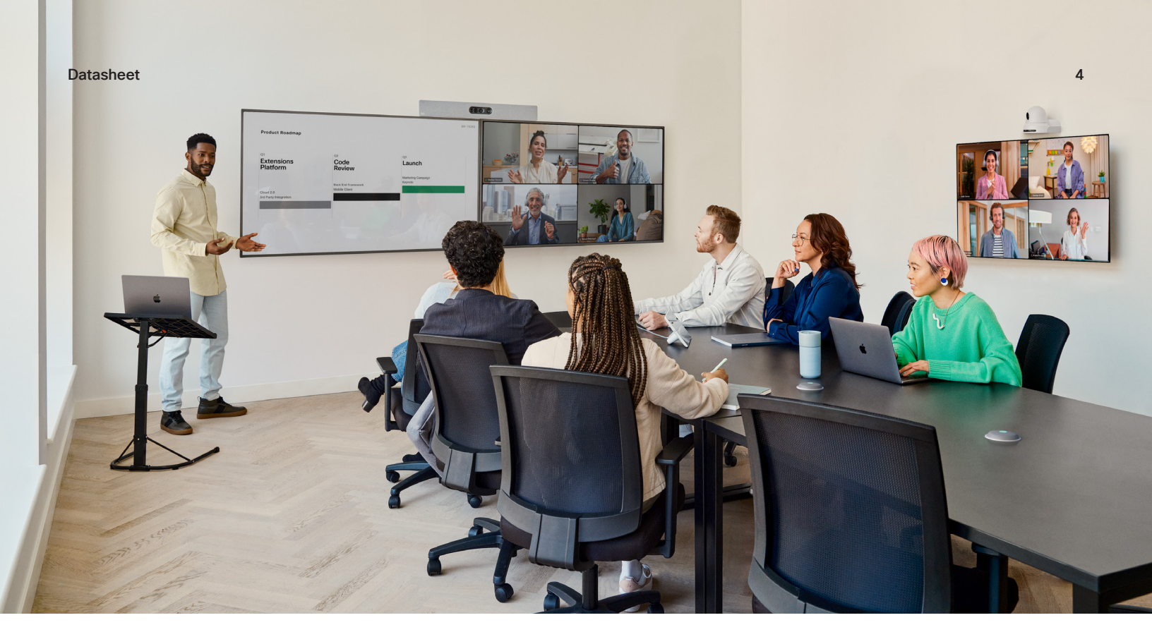
Figure 2. The Cisco Table Microphone Pro used with the extended Cisco Room Kit EQ bundle to provide multi-directional speech pickup from a large meeting room.