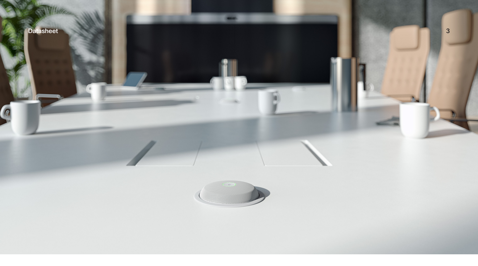
Figure 1. The Cisco Table Microphone Pro recessed into the table in a conference room.