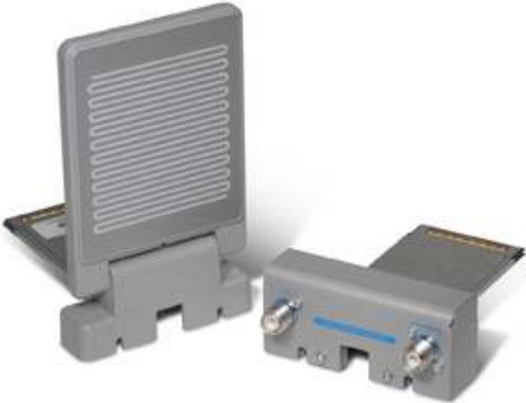
Figure 1. Cisco Aironet 1200 Series Access Points 802.11a Radio Modules

All available radios (802.11a, 802.11b, and 802.11g) provide a variety of transmit power settings to adjust coverage area size. To extend the flexibility of deployments, the 802.11a radio module is available in two versions (Figure 1). Both versions provide up to 12 nonoverlapping channels in the 5 GHz band (subject to local regulations); an additional 11 will become available in 2005 with a field firmware upgrade. One version offers dual antenna connectors for use with a wide variety of Cisco antennas to achieve extended range and application-specific coverage. The second has an integrated antenna design that incorporates diversity omnidirectional (5 dBi) and patch antennas (9 dBi). For ceiling, desktop, or other horizontal installations, the integrated omnidirectional antenna provides an optimal coverage pattern and maximum range. For wall-mount installations, the patch antenna provides a hemispherical coverage pattern that uniformly directs the radio energy from the wall and across the room. Both the omnidirectional and patch antennas provide diversity for maximum reliability, even in high-multipath environments such as offices and other indoor environments. Coupled with the broadest selection of 2.4 GHz and 5 GHz antennas in the industry, this provides users with unparalleled flexibility in cell size and coverage patterns.