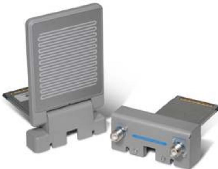
Figure 1. Cisco Aironet 1200 Series Access Points 802.11a Radio Modules

All available radios (802.11a, 802.11b, and 802.11g) provide a variety of transmit power settings to adjust coverage area size. To extend the flexibility of deployments, the 802.11a radio module is available in two versions (Figure 1). Both versions provide up to 12 nonoverlapping channels in the 5 GHz band (subject to local regulations); an additional 11 will become available in 2005 with a field firmware upgrade. One version offers dual antenna connectors for use with a wide variety of Cisco antennas to achieve extended range and application-specific coverage. The second has an integrated antenna design that incorporates diversity omnidirectional (5 dBi) and patch antennas (9 dBi). For ceiling, desktop, or other horizontal installations, the integrated omnidirectional antenna provides an optimal coverage pattern and maximum range. For wall-mount installations, the patch antenna provides a hemispherical coverage pattern that uniformly directs the radio energy from the wall and across the room. Both the omnidirectional and patch antennas provide diversity for maximum reliability, even in high-multipath environments such as offices and other indoor environments. Coupled with the broadest selection of 2.4 GHz and 5 GHz antennas in the industry, this provides users with unparalleled flexibility in cell size and coverage patterns.