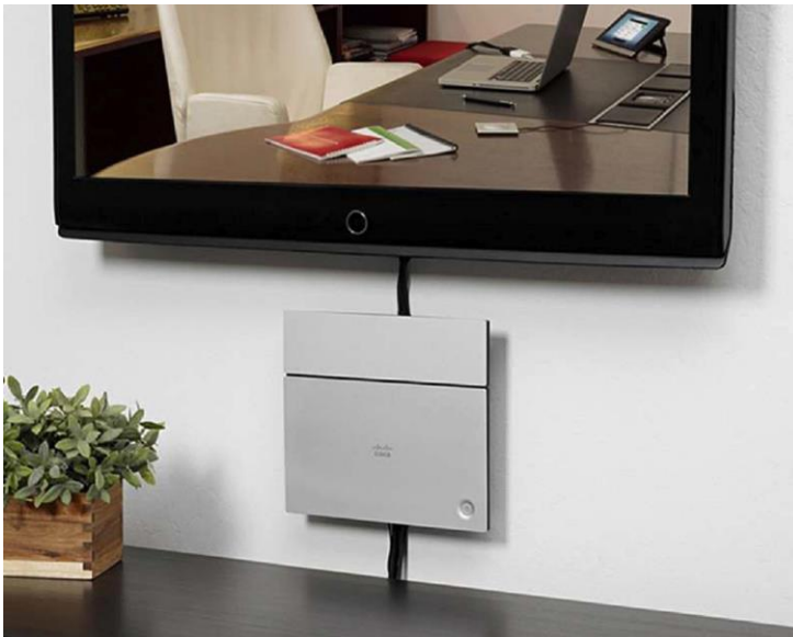
Figure 2. Cisco SX20 Quick Set on optional wall mount