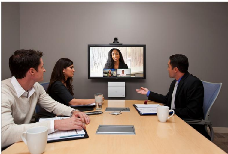
Figure 1. Cisco SX20 quick set in a small meeting room environment

Now, the SX20 Quick Set supports cloud registration to Cisco Spark Services for even faster and more cost effective deployment 1 . Cisco SX20 Quick Set is designed to truly extend the power of in-person to everyone, everywhere.