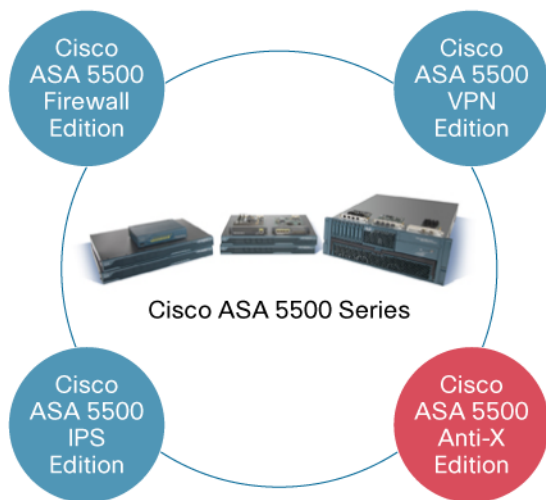
Figure 2. Complementary Solutions

Cisco and its partners offer world-class service and support that is tailored for your business. Cisco has adopted a lifecycle approach to services that addresses the necessary set of requirements for deploying and operating Cisco ASA 5500 Series security appliances. This approach can help you improve your network's business value and return on investment. For more information on Cisco security services, visit http://www.cisco.com/en/US/products/svcs/ps2961/ps2952/serv_group_home.html .