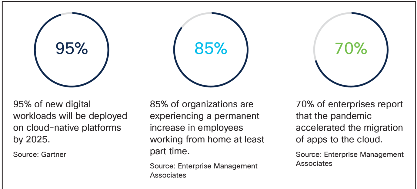
Figure 1. Trends driving migration to the cloud

This is where cloud comes in. Manufacturing IT organisations need the right blend of networking technology, simplicity of management, and operational agility to deliver hybrid work at scale. Networking teams are implementing cloud network management to: