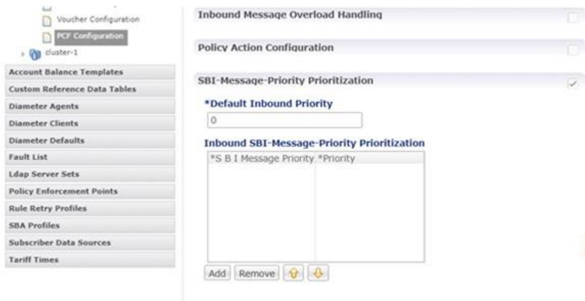
Table 10: Inbound SBI-Message-Priority Prioritization Parameters