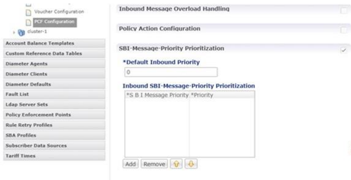
Table 10: Inbound SBI-Message-Priority Prioritization Parameters