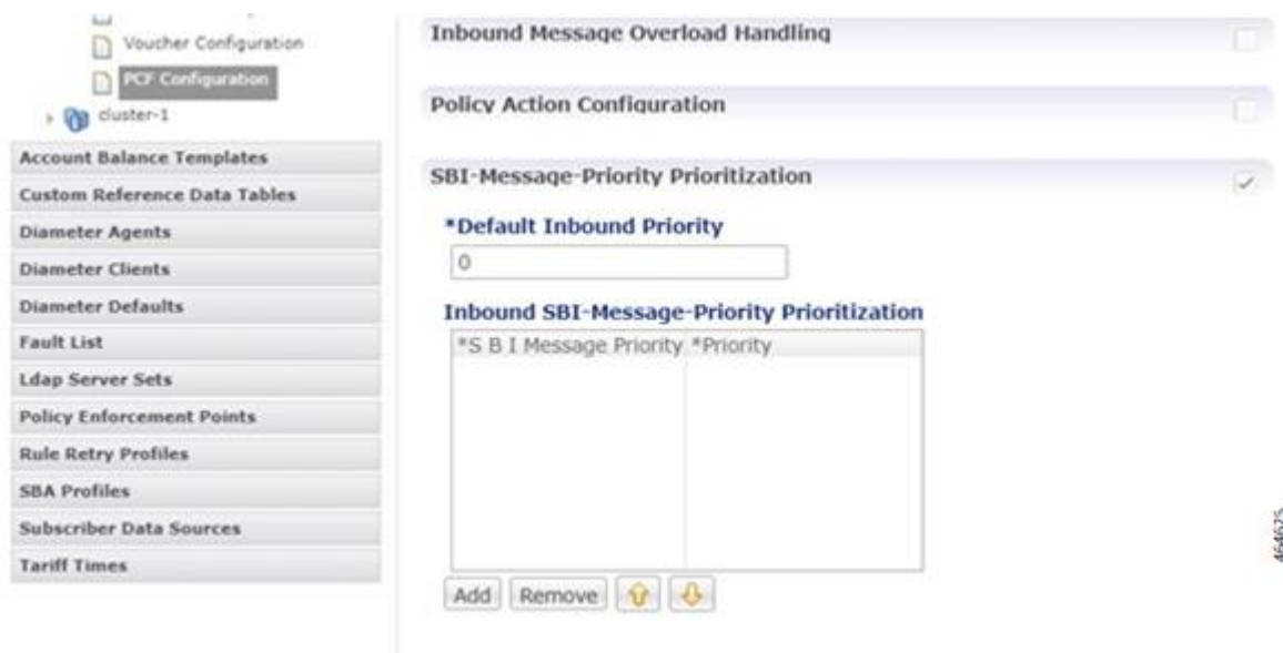
Figure 3: SBI-Message-Priority Prioritization