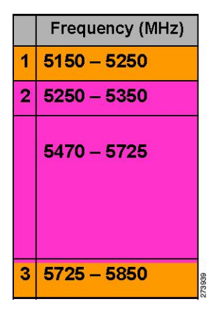
Figure 5: DFS and TPC Band Requirements

DFS is mandatory in the USA for 5250 to 5350 and 5470 to 5725 frequency bands. DFS and TPC are mandatory for these same bands in Europe.