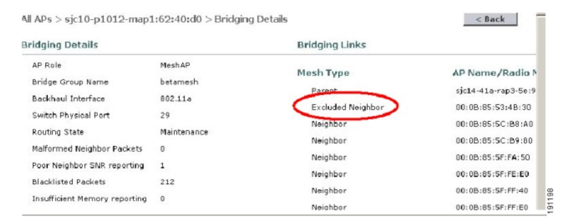
Figure 8: Excluded Neighbor