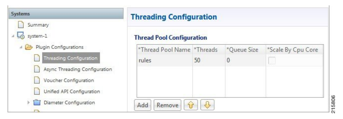
Figure 1: Threading Configuration