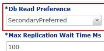
Figure 6: Db Read Preference

An example Cluster configuration is given: