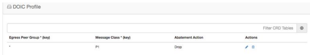
Figure 6: DOIC Profile

Default Error Message is "3002: 012 - Throttled due to DOIC congestion"