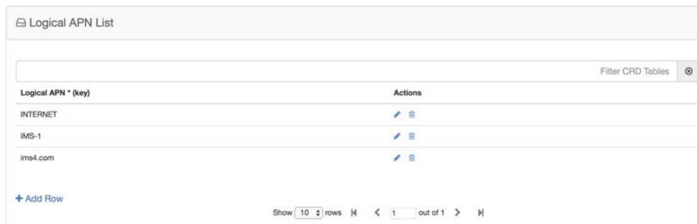
Figure 1: Logical APN List

An example configuration is shown below: