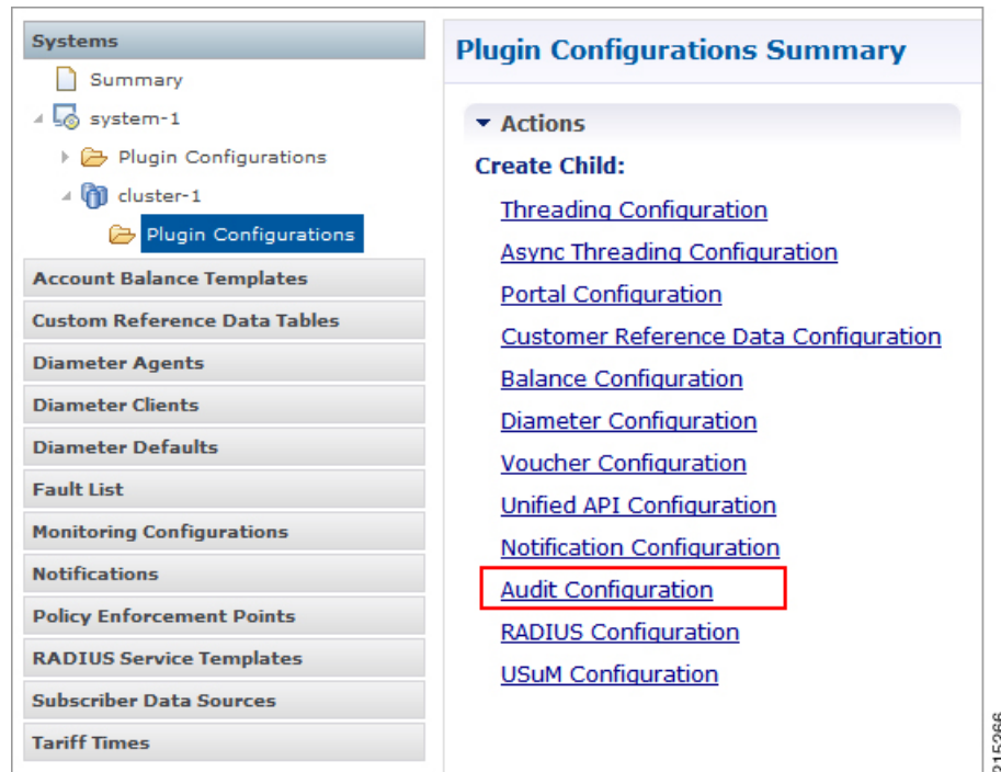
Figure 1: Plugin Configurations Summary

Step 2 Click Audit Configuration in the right pane to open the Audit Configuration dialog box.