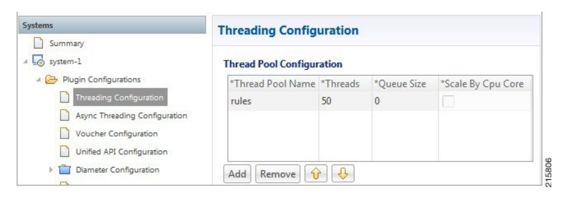
Figure 1: Threading Configuration

An example configuration is shown below: