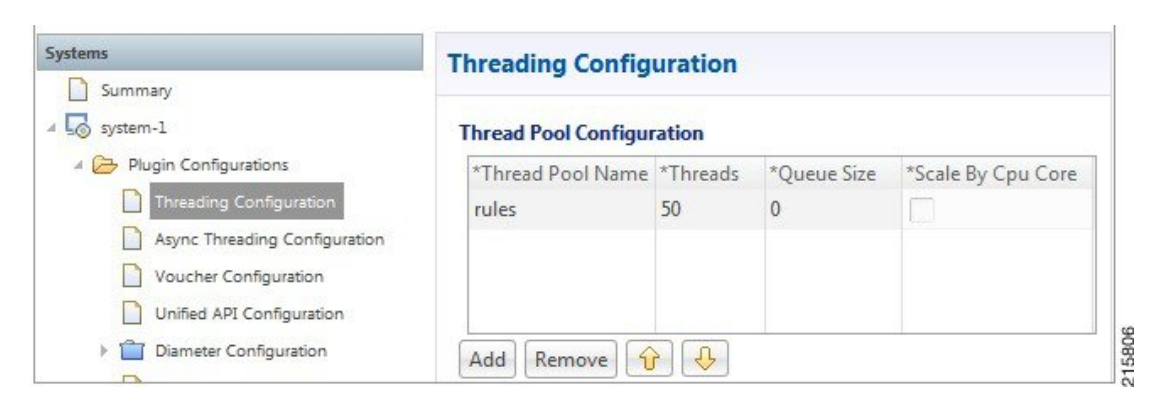
Figure 1: Threading Configuration

An example configuration is shown below: