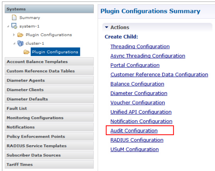
Figure 1: Plugin Configurations Summary

Step 2 Click Audit Configuration in the right pane to open the Audit Configuration dialog box.