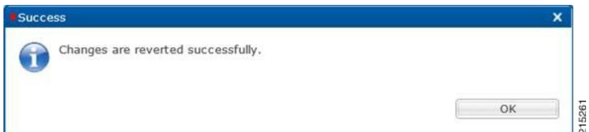
Figure 3: Success Confirmation Message