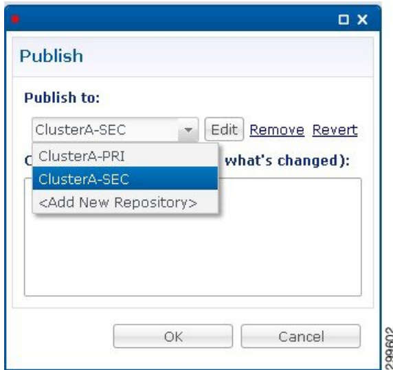
Figure 9: Publish Screen