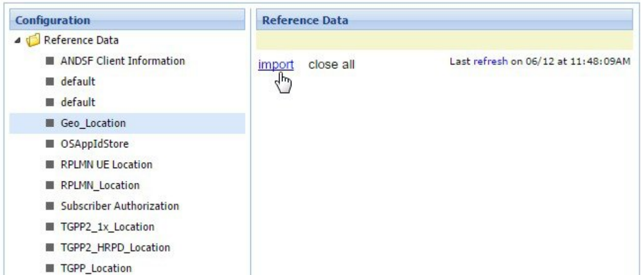
Figure 1: Import Data

Note The CRD tables whose Svn Crd Data flag is disabled do not get listed in the dropdown as import of Svn CRD table data is not supported.