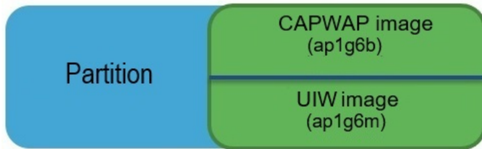
Figure 1: IW9165D Software Image Folder Structure

This image shows the folder structure where software images are stored on the IW9165D: