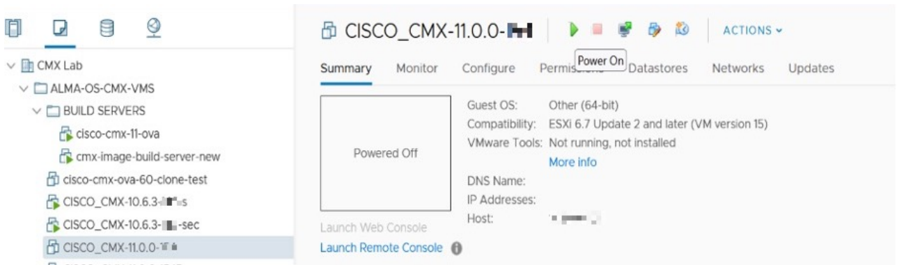
Figure 9: Power On VM

Step 12 Click Power on to power on the VM. The first boot takes a while because the new disk has to be expanded.