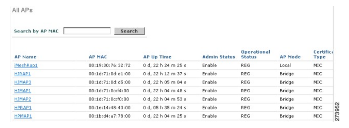
Figure 2: All APs Summary Page

Step 5 Click AP Name to see the details page and then select the Interfaces tab to see the active radio interfaces.