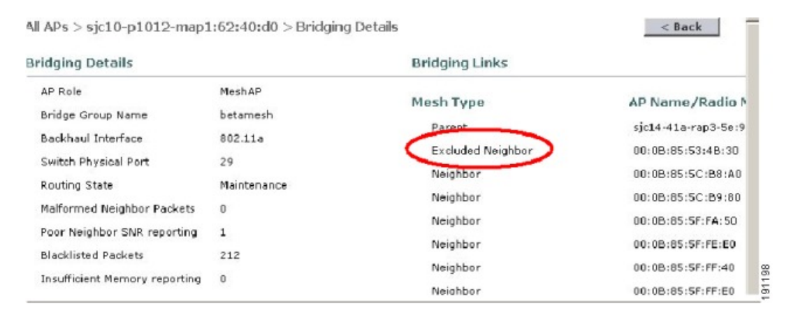
Figure 5: Excluded Neighbor

Because many nodes might be attempting to join or rejoin the network after an expected or unexpected event, a hold-off time of 16 minutes is implemented, which means that no nodes are exclusion-listed during this period of time after system initialization.