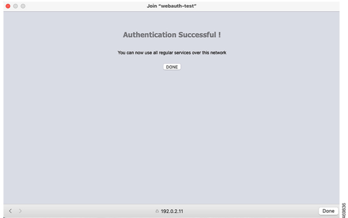
Figure 2: Authentication Successful Banner

The banner can be customized as follows: