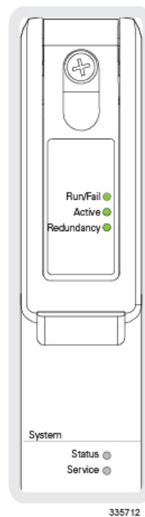
Figure 5: SSC Status LEDs

The possible states for all SSC LEDs are described in the sections that follow.