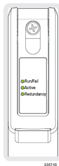
Figure 3: DPC Status LEDs

The possible states for all of the DPC/UDPC or /DPC2/UDPC2 LEDs are described in the sections that follow.