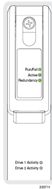
Figure 4: FSC Status LEDs

The possible states for all FSC LEDs are described in the sections that follow.