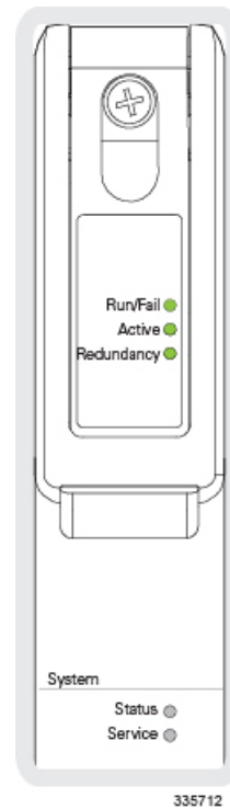
Figure 5: SSC Status LEDs

The possible states for all SSC LEDs are described in the sections that follow.