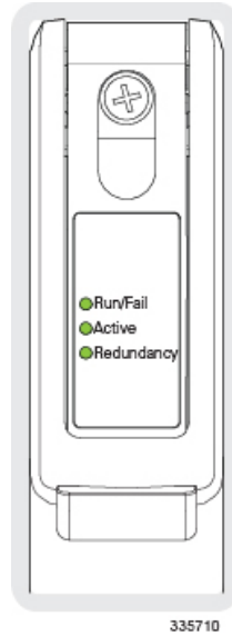
Figure 3: DPC Status LEDs

The possible states for all of the DPC/UDPC or /DPC2/UDPC2 LEDs are described in the sections that follow.