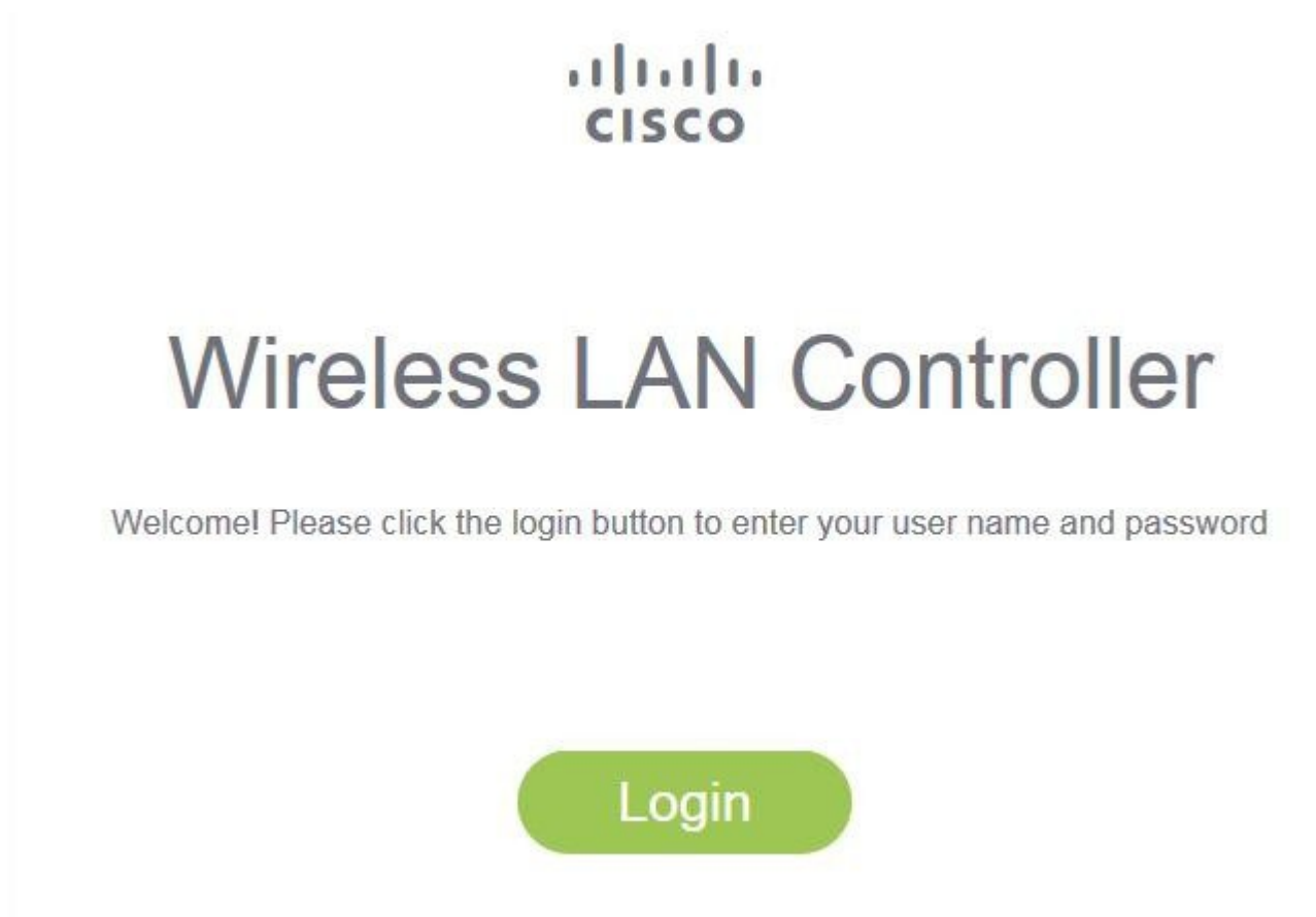
Figure 1: Cisco Mobility Express Wireless LAN Controller Web Interface Login

The Cisco Mobility Express controller uses a self-signed certificate for HTTPS. Therefore, all browsers will display a warning and ask you whether you wish to proceed with an exception or not when the certificate is presented to the browser. Accept the warning in order to access the Mobility Express Wireless LAN Controller login page.