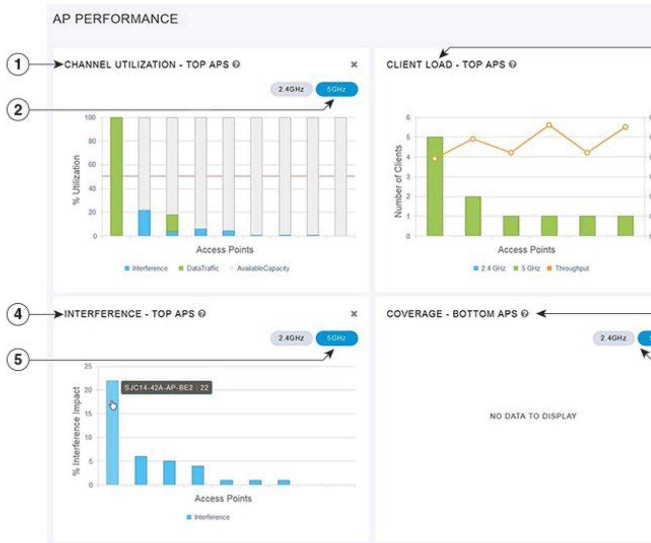
Figure 3: Wireless Dashboard - AP Performance