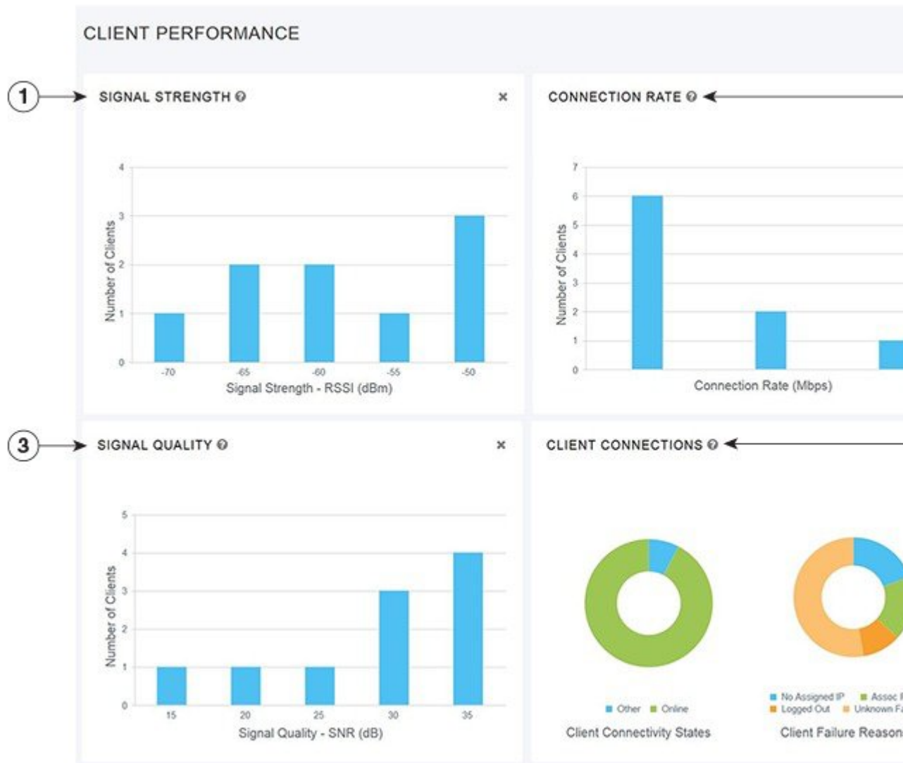
Figure 4: Wireless Dashboard - Client Performance