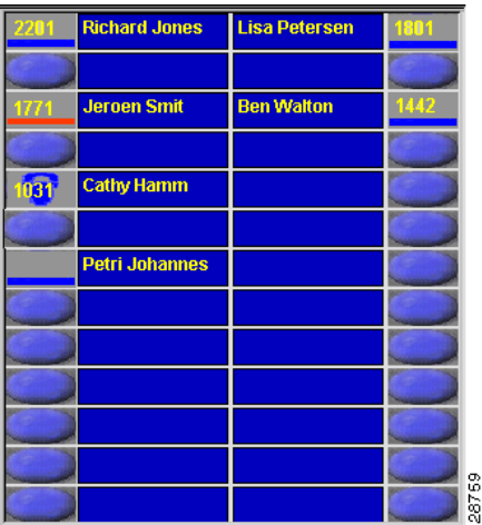
Figure 4-1 Speed Dial Area

The speed dial area indicates the status of the user’s phone using the same icons as in the directory, as shown in Figure 4-1.