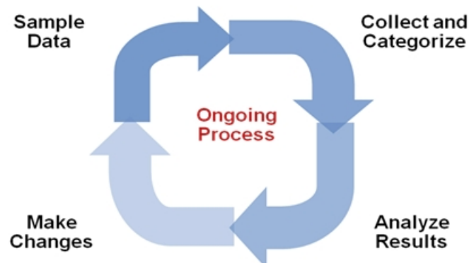
Figure 1: Capacity Planning Process

Change an existing Unified ICM/Unified CCE deployment in small steps. Then analyze the impact of each step with a well-established, repeatable process. This process includes the following phases (steps):