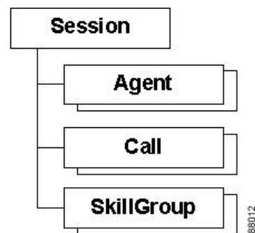
Figure 3: CIL Object Model Object Interfaces

The Client Interface Library's Object Interface layer provides a set of objects that create abstractions for all of the call center interactions supported. Client programs interact with the CIL objects by making requests from the objects, and querying the objects to retrieve properties. The following figure illustrates the CIL Object Model Object Interfaces.